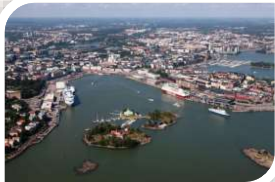
Restaurant Saaristo at Klippan island