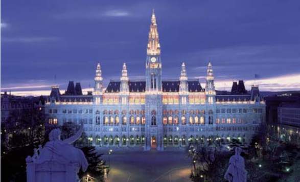
Vienna City Hall

20:00 Reception by the Mayor of Vienna, Vienna City Hall